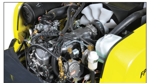
NISSAN K25 Engine