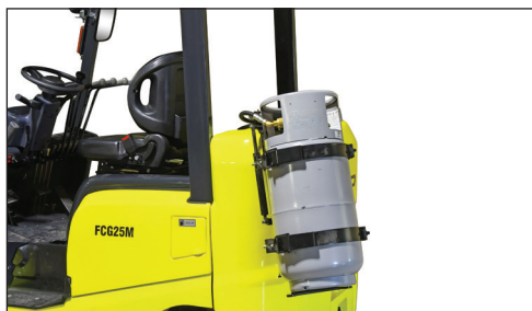
Swing Out & Down Tank Bracket