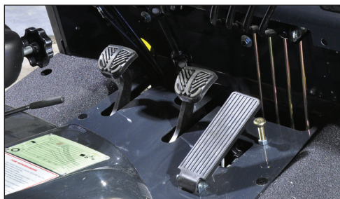
Ergonomically placed foot pedals, easy to use.