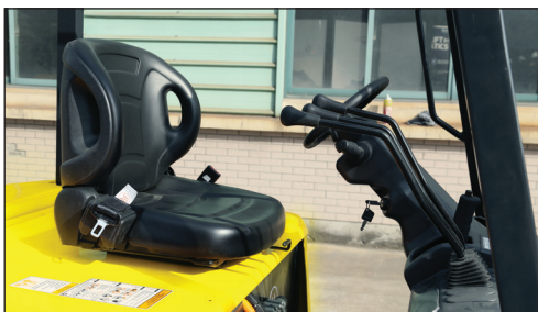
OPS: preventing accidents and keeping workers in the operating areas safe.