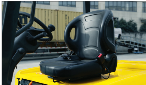
Ergonomic seat for a smoother and more comfortable drive.