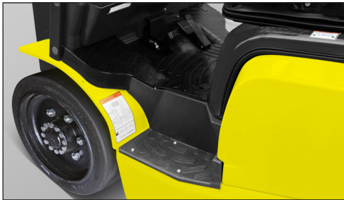
Wide step for easy entry, and spacious leg & foot room.