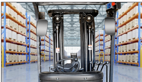
Wide view mast offers good driving vision.