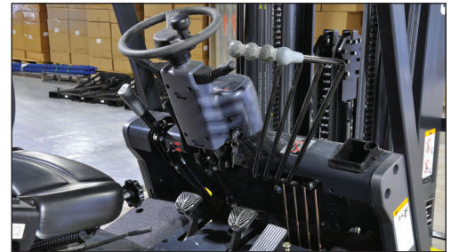
Adjustable steering column according to operator's preference to reduce fatigue.