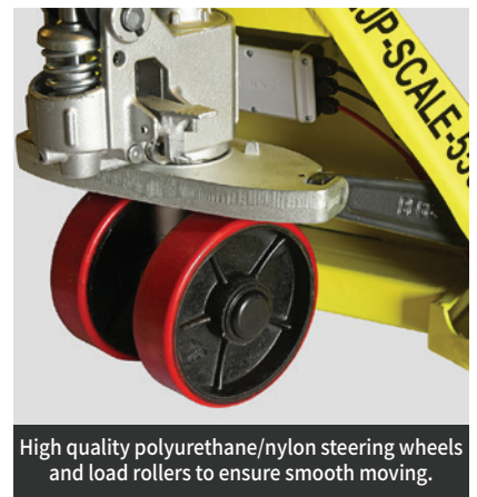
High quality polyurethane/nylon steering wheels and load rollers to ensure smooth moving.