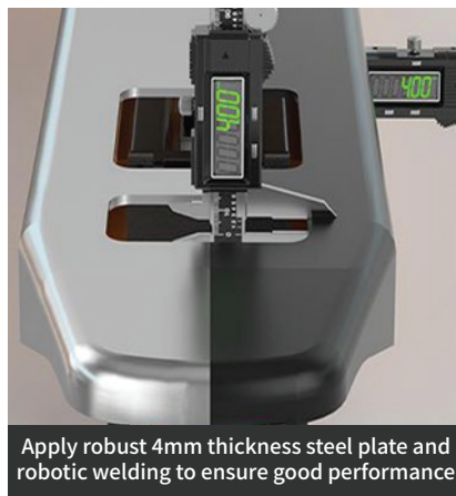
Apply robust 4mm thickness steel plate and robotic welding to ensure good performance