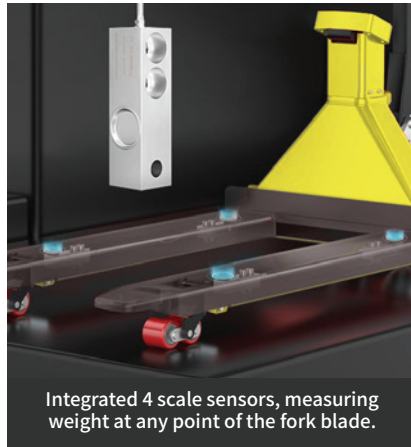
Integrated 4 scale sensors, measuring weight at any point of the fork blade.