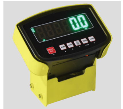
Integrated 4 scale sensors, measuring weight at any point of the fork blade.