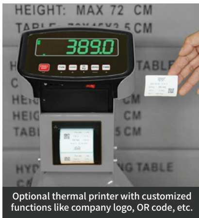
Optional thermal printer with customized functions like company logo, OR code, etc.